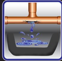
INDOOR WATER CONTROL