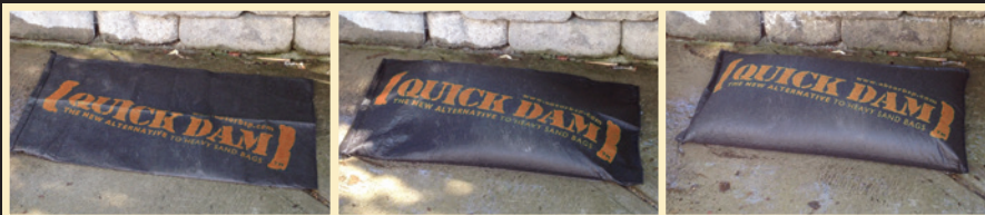
Activates & grows when wet